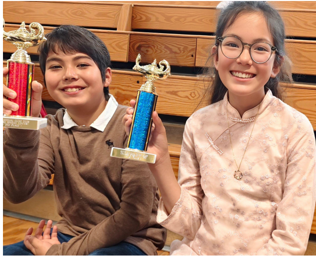
2025 California Association of Teachers of Chinese (CLTAC) Mandarin Speech Contest

Recognizing the staff, programs, schools, and partnerships behind student success