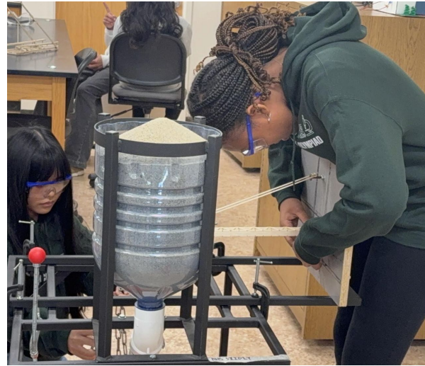
2025 Science Olympiad Regional Competition