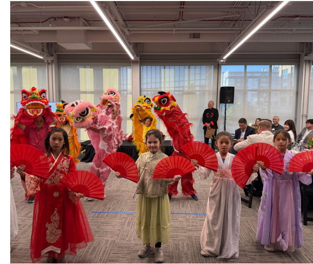
2026 San Mateo County Asian Pacific Islander Heroes Legacy Award

Together We Shine highlights excellence across classrooms, schools, programs, and community partnerships.